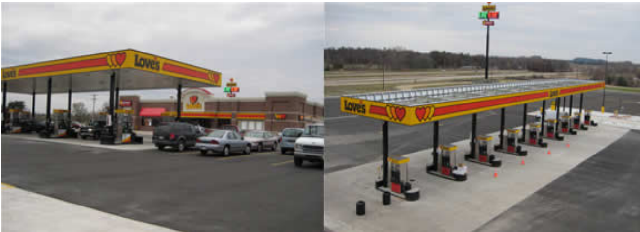
Figure 2 Present Love's Travel Plaza

The PECFA program provided more than $650,000.00 in funding to define and remediate petroleum contamination on the property. Following cleanup activities, Love's invested over $5 million to develop the property into their newest travel plaza, employing over 50 people at the 24-hour travel plaza and restaurant.