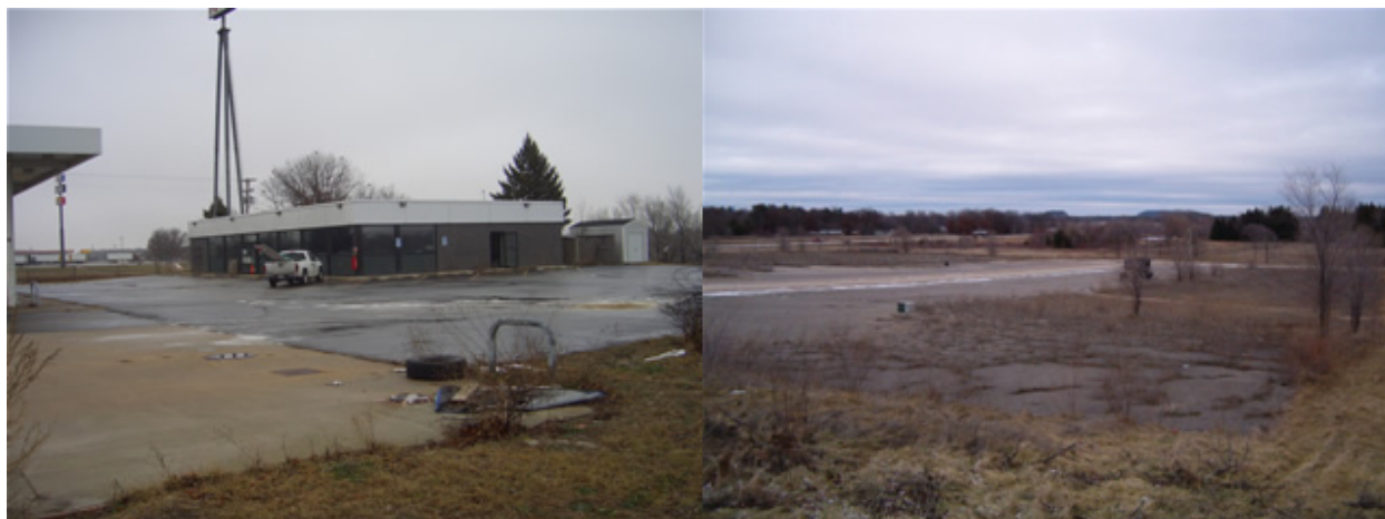
Figure 1: Photo of Stockman's East prior to PECFA cleanup

Located in the west central region of the state, the Village of Oakdale is situated on the cusp of Interstate Highways 90/94. These two major interstate highway arteries divide just north of Oakdale, serving the north and western areas of the state. Because of its location along the interstate, the village has a history of supporting large travel plazas. One of the many travel plazas in this area was the former Stockmen's East.